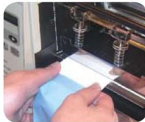
Step 1. Lock Printhead

Clean Start® is an innovative, patented printhead cleaner that's built right into the ribbon. It removes debris before it builds up on the printhead. All it takes is 6 seconds and 2 easy steps.