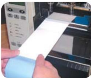
Step 2. Pull CleanStart

Simply pull it through the locked printhead at the start of each new ribbon. The result is consistently sharp bar code and text print quality throughout your entire label run.